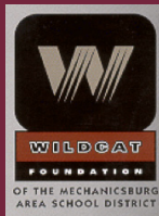
In the beginning

Our goals are to provide funding and support for innovative programs and projects not within the district’s traditional budget or curriculum. Funds raised through general donations, memorial contributions, endowment interest and special events to include Community Day, an annual golf outing, and Wildcat Night, and those contributed through the Educational Improvement Tax Credit (EITC) program, are later distributed through an annual competitive grant process. Teachers, advisors, clubs, and organizations may apply for funds; a committee of the board reviews all applications and recommends support. The committee strives to fund projects that have the greatest impact on District teachers, instructors, coaches, and their students.