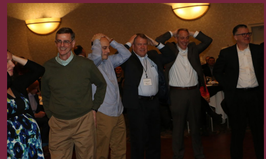
Enjoying a game of Heads & Tails at Wildcat Night