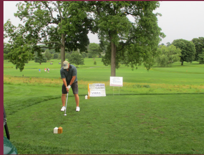
Teeing up on Hole in One